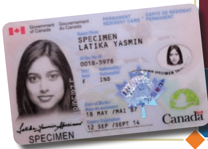
PHOTO SPECIFICATIONS Permanent Resident Card